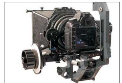
MOVIEtube PR Lite rear perspective with monitor view

Quick Release with 1/4" Tripod thread connects either to the front of an Sony quick release plate or to the tripod plate directly