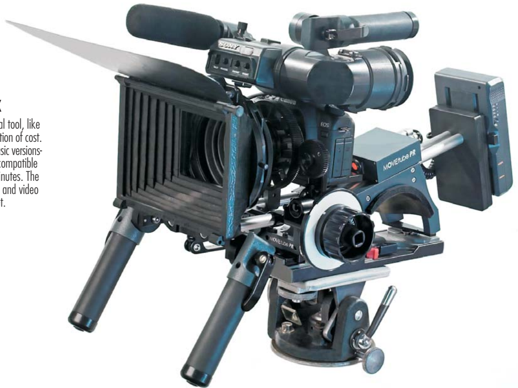
MOVIEtube PR Production with shoulder rest, viewfinder and film/video accessories

MOVIEtube PR converts video DSLRs into a professional tool, like a HD movie camera with shallow depth-of-field at a fraction of cost. MOVIEtube PR is a modular system and comes in two basic versions—Production and Lite. Therefore both versions are fully compatible with each other and can be up- and downgraded in minutes. The rig is trouble free and compatible with the 35mm film and video gear — ensuring a smooth and trusted workflow on set.