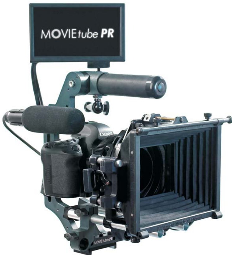
MOVIEtube PR Lite with 15mm video and 19mm film bars, microphone and monitor