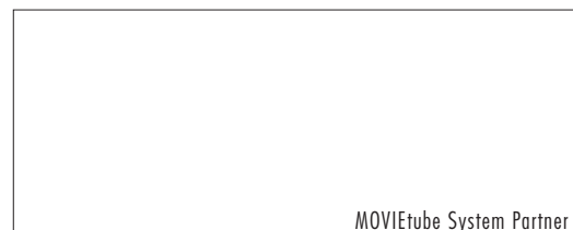
MOVIEtube System Partner

Specifications are subject to change without notice