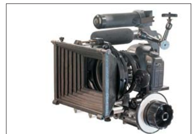
MOVIEtube PR Lite with follow focus and articulating arm